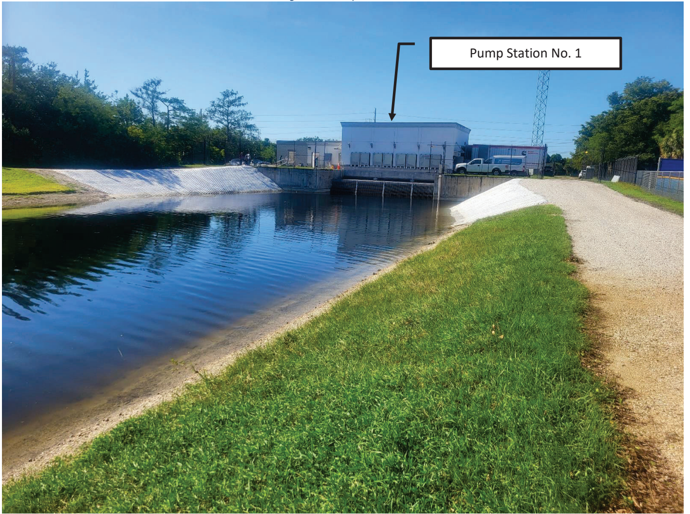
Figure 2 – Pump Station 1